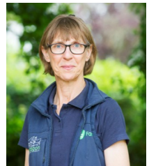
By Anne Abbs

A number of EU states are considered to be BVD free, currently Austria, Denmark, Finland, Sweden and some regions of Germany. In addition to these The Republic of Ireland and some of the other German regions have approved eradication schemes. This means that there are some requirements that have to be fulfilled to allow live cattle exports to these countries/regions –