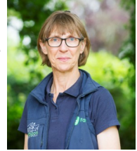
By Anne Abbs

Many farmers castrate their own calves but as vets we find that, when we come to do the Herd Health plan, many are unaware of the legal requirements and best practice. Only trained, competent people should perform castration; this reduces the risk of the procedure failing and, when the calf grows into a stirk, of him still being able to serve heifers, but also reduces the risk of mistakes which can be fatal.