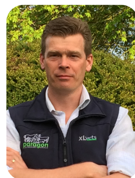
By Victor Oudhuis

Having a good colostrum protocol is vital, but maybe it should not be the only priority when feeding new-born calves.