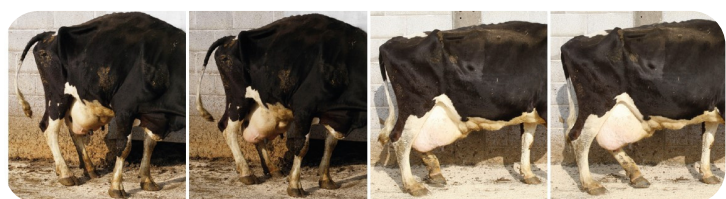
Severely impaired mobility – Score 3

Recent research has focused on the long-term effects of lameness events on the anatomy of a cow's foot. Even mild lameness events can trigger inflammation resulting in structural changes to the foot, making the cow more susceptible to future lameness events. Detecting lame cows quickly and providing effective treatment is key to reducing the cow's risk of going lame again. Sensible targets would be for all score 2 cows to have their feet looked at within a week and score 3 cows being on straw and trimmed as soon as possible.